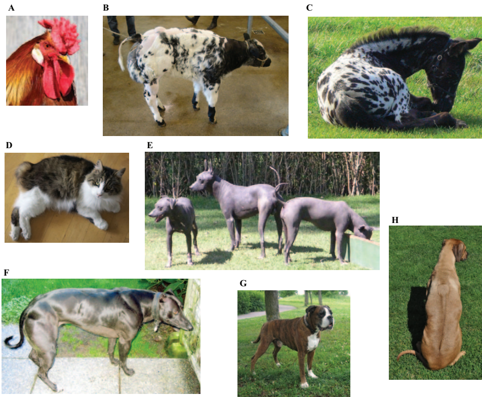
Figure 1. Photos of (A) a rose comb heterozygote in chickens (Imsland et al. 2012), (B) a crooked tail homozygote in Belgian Blue cattle (A. Sartelet and C. Charlier), (C) a leopard complex spotting heterozygote in horses (R. Bellone), (D) a tailless heterozygote Manx cat (Creative Commons), (E) a hairless heterozygote Mexican hairless dog (Creative Commons), (F) a homozygote bully whippet dog (D. Mosher, H. Parker, and E. Ostrander), (G) a flash heterozygote boxer dog (N. Salmon Hillbertz), and (H) a homozygote Rhodesian ridgeback dog (N. Salmon Hillbertz).

horses even though as a homozygote it was presumed to have caused night blindness. Pruvost et al. (2011) suggested that the leopard phenotype in heterozygotes might have advantageously provided camouflage in the snowy Pleistocene. However, because the frequency of the leopard phenotype is substantial in a number of modern breeds, it appears that artificial selection for the phenotype is now important.